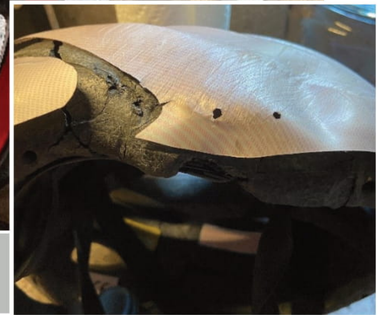
Actual photos of the woman's helmet post fall